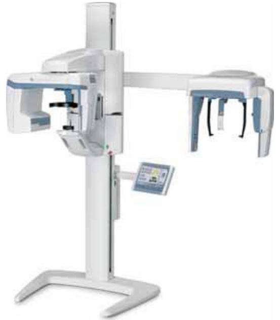
Orthopantomograph Model OC200D Pan/Ceph