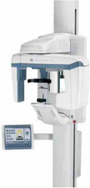
Orthopantomograph Model OP200D Panoramic X-ray